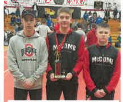
McComb JH Wrestling team was BVC runner up. Congratulations!